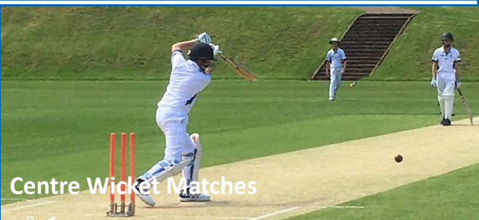
Centre Wicket Matches